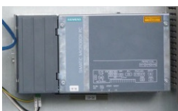
Picture 3-2) Optional industrial computer (picture shows type EQ2692-...) within large cabinet AC-2161 only.